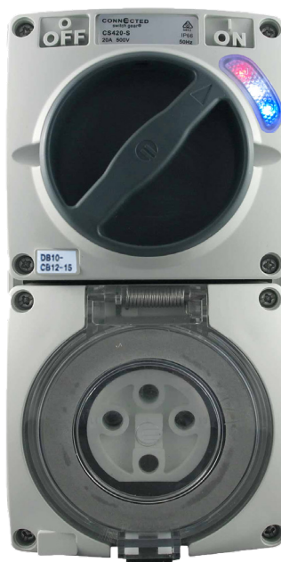
CS420-S with accessories